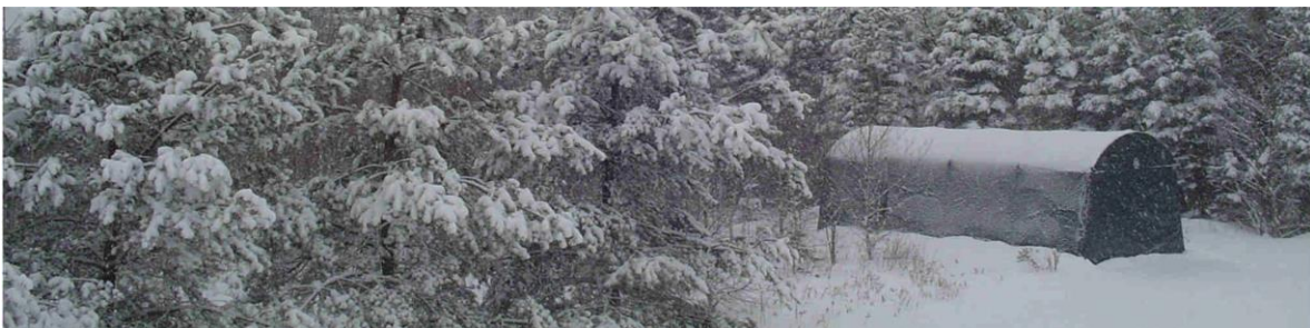
Protection from Canada's harshest weather