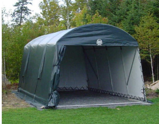
12' x 20' one car garage

Note the wind straps on the side; standard with our Elite Series