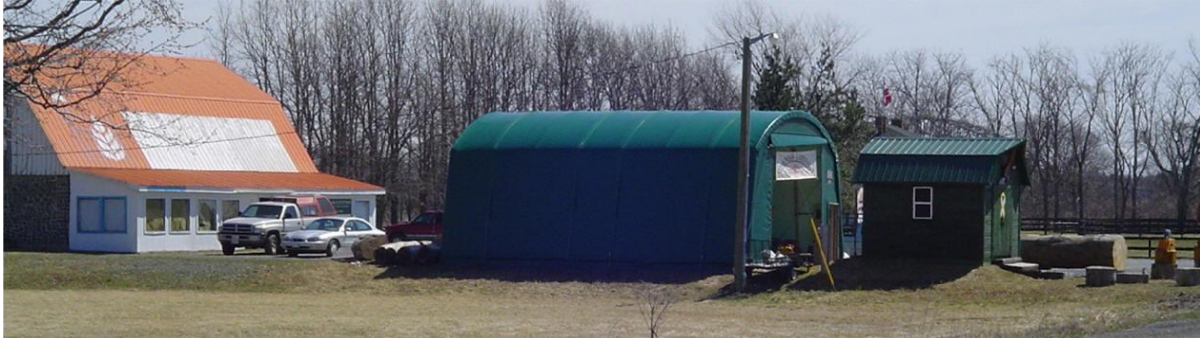
Great for business expansion; 24' x 35' with a 12' high door shown above.