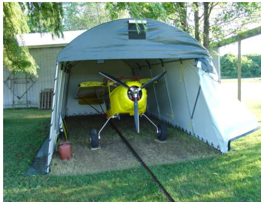
Note the fabric vent open at top front (also one at back)

Note the wind straps on the side; standard with our Elite Series