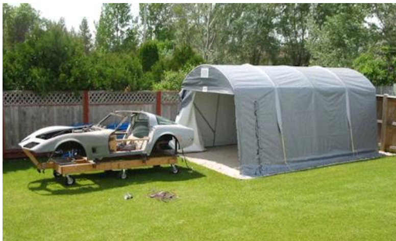
Hobby hangout; 12' x 20' shown above.

www.cantarp.com 1-888-226-8277 Saskatoon, Sk.