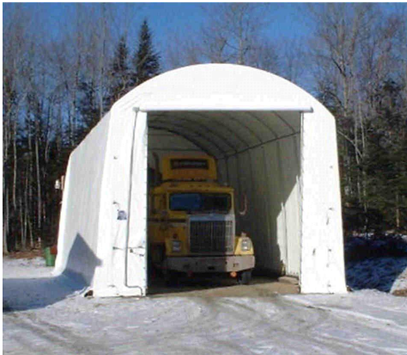
20' x 35' heavy truck garage - note the roll up door crank shown above

www.cantarp.com 1-888-226-8277 Saskatoon, Sk.