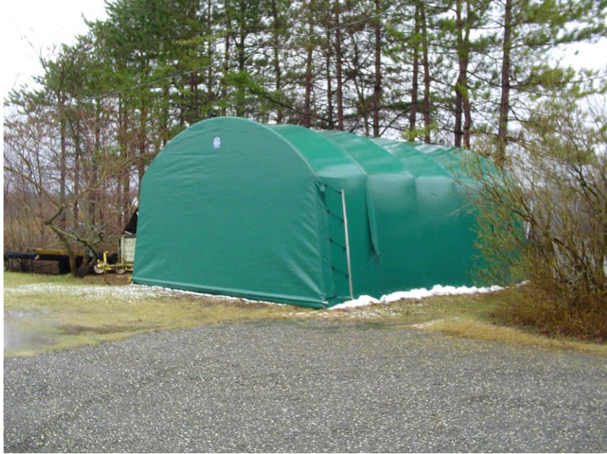
20' x 25' two car garage (8' high door) shown above