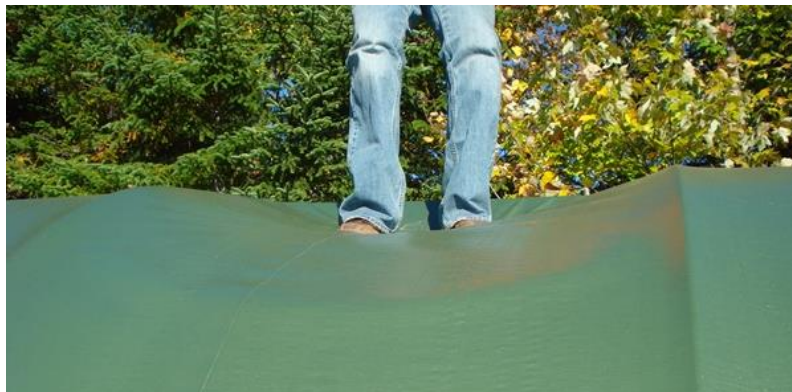
Unmatched fabric and seam strength!

www.cantarp.com 1-888-226-8277 Saskatoon, Sk.